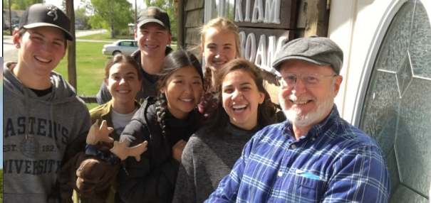
These delightful young people are the Master's University G.O. Team 2021

We commit to honor your gift by fulfilling our mission and purpose: preaching and teaching the word of God over the airwaves in Alaska. VFCM retains complete control over the use of all donated funds.